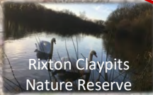
Rixton Claypits Nature Reserve