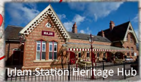
Irlam Station Heritage Hub