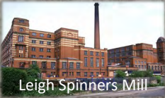
Leigh Spinners Mill