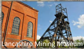
Lancashire Mining Museum