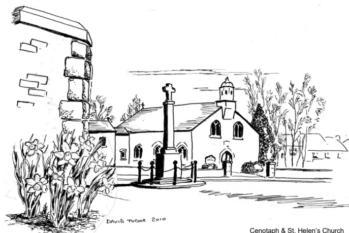
Cenotaph & St. Helen's Church

6 In 110m ignore path to right that crosses the field and keep straight on following the fence line. In a further 60m ignore the waymark pointing left for the path that crosses the hedge line and continue on the path bearing to the right towards the houses on Dam Lane.