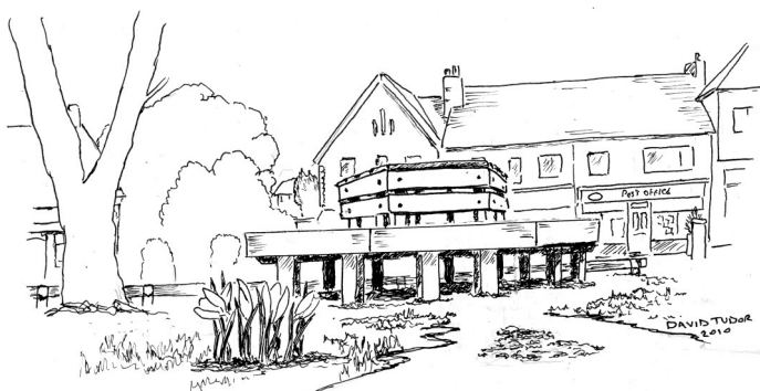
Glazebrook Village Green

3 Turn right and proceed up Dam Head Lane. After crossing the railway bridge continue on the lane around the bend before turning right down Bank Street and crossing over the railway once more. Continue down the length of Bank Street, passing the disused military camp on your right, for 800m. Just before the junction with Glazebrook Lane enter Glazebrook Village Green through a wooden gate on your right hand side.