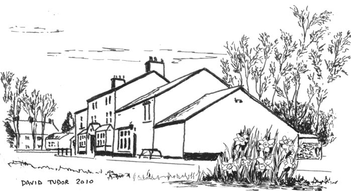
The Black Swan

⑨ At Hollins Green Scout Centre follow path between fenced gardens to emerge onto Manchester Road. (If required, the Village Community Shop and Cafe is a short distance to the right.) Turn left down the road passing The Black Swan public house on your left and the Community Hall on your right to return to the lay-by at the start of the walk.